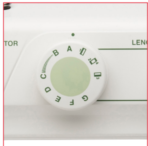
Stitch Selection Dial