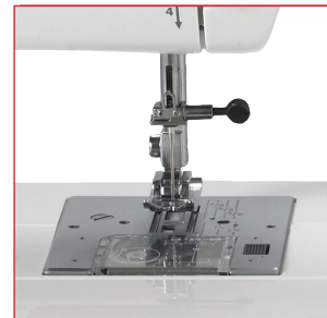
Snap-on Presser Foot